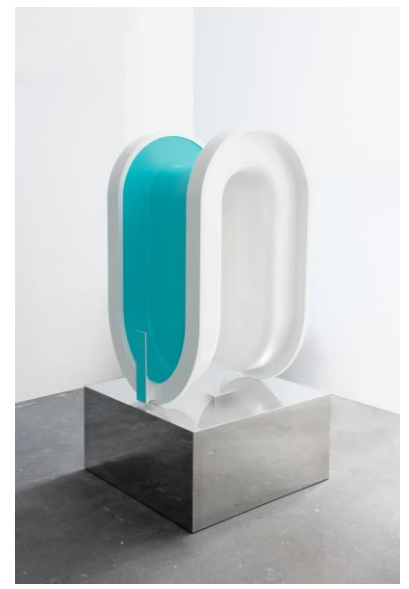
Human Scale (Bent Pool), 2018. Silica sand, resin, aluminium, steel, lacquer, polyurethane, and mirrorpolished stainless steel, 47 1/4 x 26 x 25 1/4 in. (120 x 66 x 64 cm). Private Collection.

Created as a male counterpart to Denmark's The Little Mermaid sculpture, Elmgreen & Dragset's version includes a young man seated in the same posture as the famous sculpture of the female mermaid. In place of the iconic fish tail of Edvard Erikson's 1913 sculpture, the artists