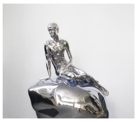
He (Silver), 2013. Epoxy resin, polyurethane cast, silver coating, and clear lacquer, 74 3/4 x 55 x 39 1/3 in. (190 x 140 x 100 cm). Private Collection, Paris.