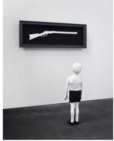
One Day, 2015. Aluminum, lacquer, glass, wood, fabric, and clothes, Figure: 41 \times 15 \ 3/4 \times 15 \ 3/4 in. ( 104 \times 40 \times 40 \ cm ), Vitrine: 21 \ 2/3 \times 57 \times 7 \ 5/8 in. ( 55 \times 145 \times 20 \ cm ). Coleción Fundación Maria Jose Jove, A Coruña, Spain.