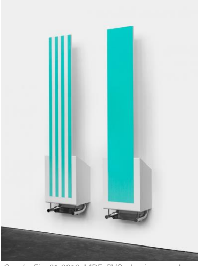
ouple, Fig. 21, 2016. MDF, PVC, aluminum, and stainless steel. Each: 86 3/4 x 18 5/8 x 12 1/2 in. (220.3 x 48 x 32 cm). Private Collector.