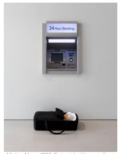
Modern Moses, 2006. Carrycot, bedding, wax figure, baby clothes, and stainless-steel cash machine, 73 1/2 x 28 x 14 1/2 in. (186.5 x 71 x 37 cm).