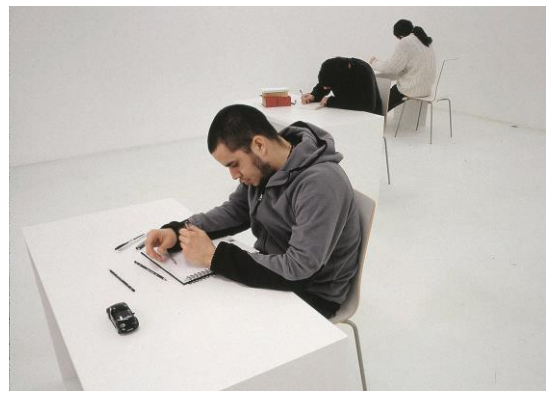
Paris Diaries , 2003. Performers, tables, notebooks, writing tools, and personal items, Desks each: 29\,1/2\times63\,1/3\times26 in. (75 x 161 x 66 cm). Installation view: Paris Diaries, Perrotin, Paris, 2003.

Create your own space for reflection. Spend five minutes recording your thoughts, frustrations, successes and experiences. How do your words create a portrait of you?