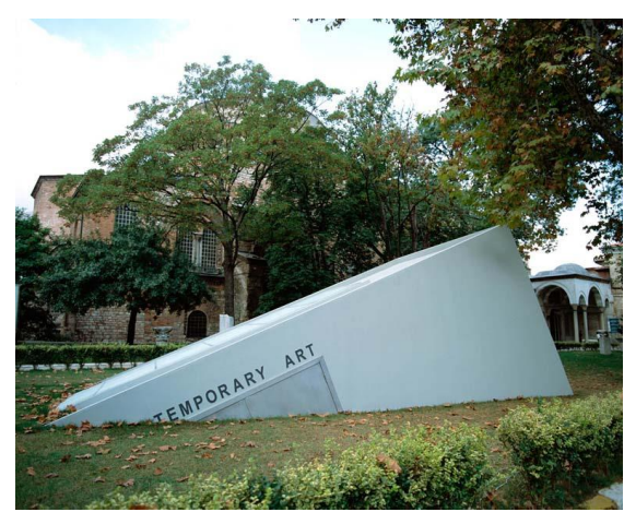
Traces of a Never Existing History/Powerless Structures, Fig. 222, 2001 Wood, stainless steel, aluminum, perspex, paint, cement, vinyl profile lettering, and fluorescent lights, 122 \times 169 1/3 \times 307 in. (310 \times 430 \times 780 cm). Installation view: 7th Istanbul Biennial, 2001.

Find an artwork that shows an everyday object that has been changed in some way. What power did this object originally have? How did the artists alter it or take away its power?