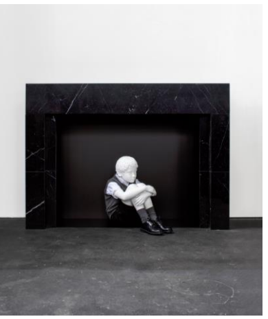
Invisible, 2017. Bronze, marble, wood, lacquer, and clothes, Fireplace: 49 1/4 \times 33 7/8 \times 17 3/4 in. (125 \times 86 \times 45 cm), Figure: 24 1/2 \times 10 1/4 \times 25 1/4 in. (62 \times 26 \times 64 cm). Nicola Erni Collection.