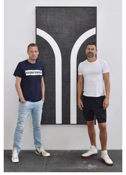
Michael Elmgreen and Ingar Dragset

Elmgreen & Dragset: Sculptures / September 14, 2019 – January 5, 2020