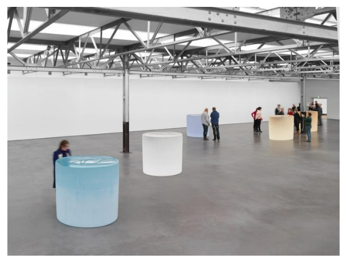
Roni Horn, Roni Horn Installation View

Exhibition view of Roni Horn at the DePont Museum, Tilburg, Netherlands, January 23-May 29, 2016. Photograph: Stefan Altenburger Courtesy of the artist and Hauser & Wirth. © Roni Horn