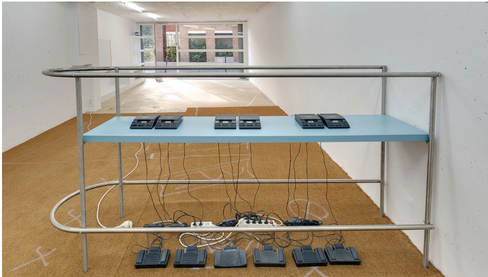
Installation view: Anne Le Troter, De l'interprétariat , 2016, Arnaud Dechin Galerie, Paris, France, September 14 – October 14, 2016.

color, length of hair, body build, etc.); they then transition to describing the difference between murmuring and whispering; and finally conclude the work by describing the sound of their voice as a whisper. Emanating from beneath plastic seating reminiscent of waiting rooms or transit stops, the resulting experience highlighted the discrepancy between form and content: the ASMR artists' whispering technique suggested the viewer had stumbled upon something illicit or clandestine, while their language begins as rote or somewhat boring, before progressing into a meta discourse on ASMR and whispering.